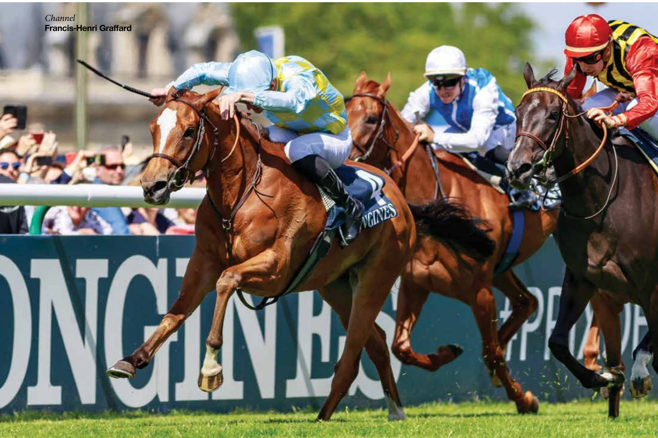
Channel Francis-Henri Graffard

The body requires a balance of these two fatty acid groups and an imbalance can lead to an altered physiological state so, for this reason, levels supplied in Baileys feeds are calculated to help maintain this balance. Soya is a good source of Omega 6 fatty acids and linseed is rich in Omega 3s; both are included in Baileys Outshine high oil supplement which is included in several mixes to supply an elevated oil content.